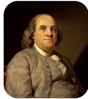
Ben Franklin (1705-1790)