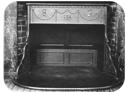
Franklin Stove more heat, less smoke