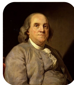
Ben Franklin (1705-1790)