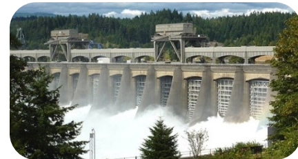
Bonneville Dam, OR Columbia River

One of the enduring legacies of the Oregon Trail was the expansion of United States territory to the West Coast. America now stretched from sea to sea. With additional citizens, the Oregon Country became the states of Idaho, Washington, and Oregon. People built towns with thriving industries like farming, timber, mining, and manufacturing. The Columbia River has become an important source of hydroelectricity for the region, like Seattle and Portland.