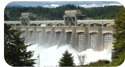
Bonneville Dam, OR Columbia River

One of the enduring legacies of the Oregon Trail was the expansion of United States territory to the West Coast. America now stretched from sea to sea. With additional citizens, the Oregon Country became the states of Idaho, Washington, and Oregon. People built towns with thriving industries like farming, timber, mining, and manufacturing. The Columbia River has become an important source of hydroelectricity for the region, like Seattle and Portland.