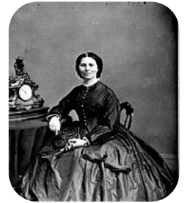
Clara Barton (1821-1912)