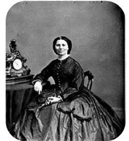
Clara Barton (1821-1912) Founder of American Red Cross