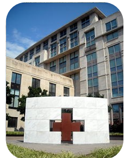
American Red Cross Headquarters Washington, DC